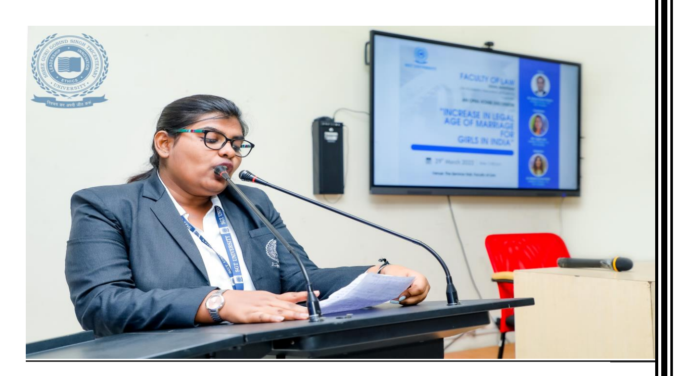
Figure:01 A student is presenting her views