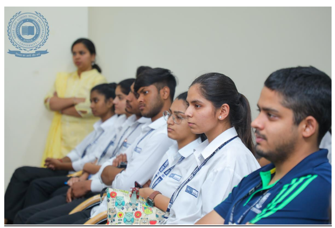
Figure:04 A section of Audience