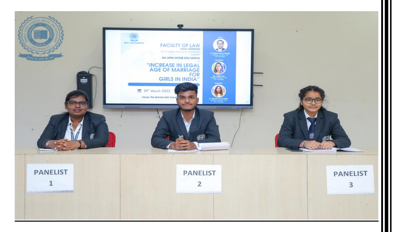
Figure:03 Presentation of Panellists