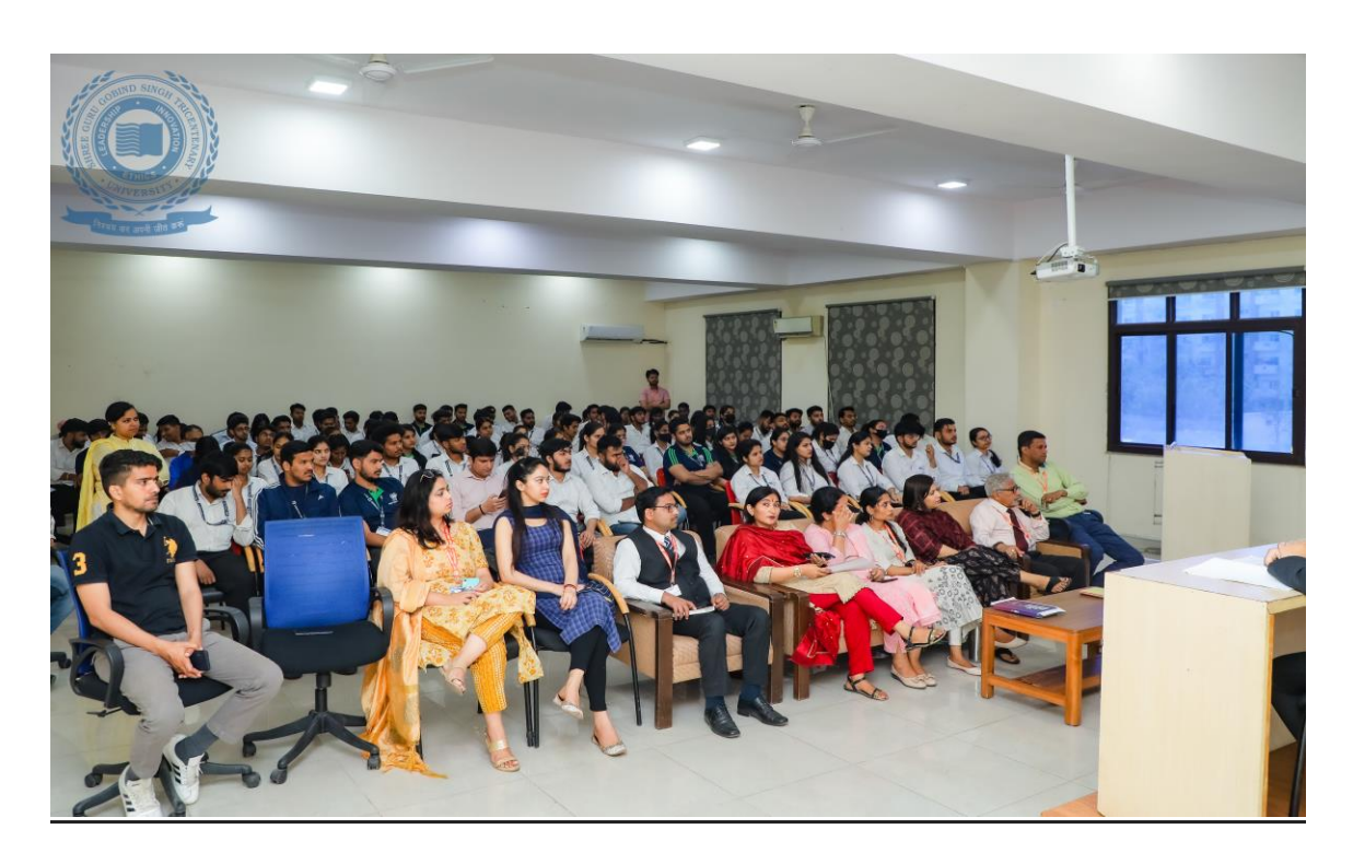
Figure:02 a panoromic view of audience